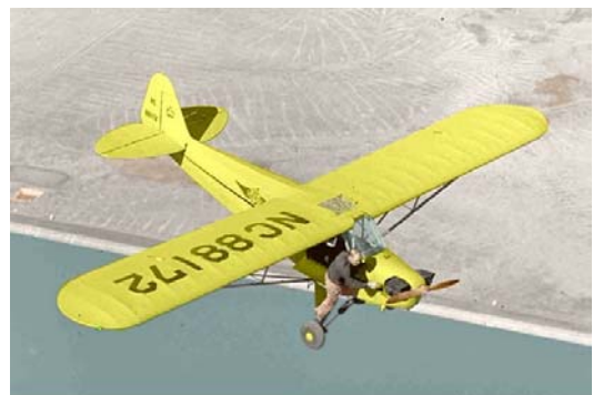
Unapproved engine restart technique....