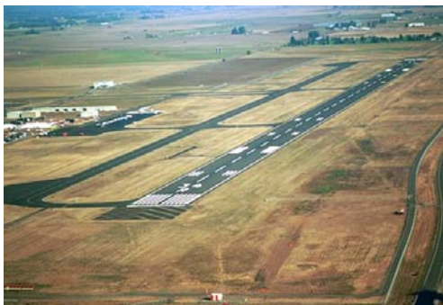
Base to Final EUG 34R