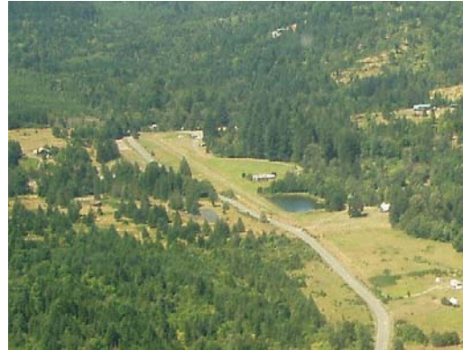
High left base, OR05 RWY25

Our group has flown to the Flying M several times and I think everyone has always enjoyed going there.. Weather permitting we will make the Flying M our Fly-Out destination this month.