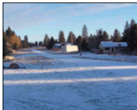
The Pilot Butte Airport, cold and snowy

The weather was checked several times and e-mails were sent to keep everyone up to date and assure them we really were going to go.....well.....almost as an after thought I called the F.B.O. to verify that the two courtesy cars would be available (after all who would be using them on such chilly Saturday morning??). Guess what....they were both gone for the day. A few quick calls checking weather etc. and the destination was changed to Klamath Falls.