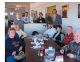
The World's "Problem Solvers" enjoying the Satellite Café,