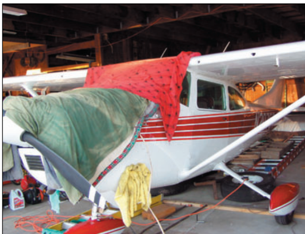
At the Pilot Butte airport, Don's 182 is all snuggled in to keep it warm.